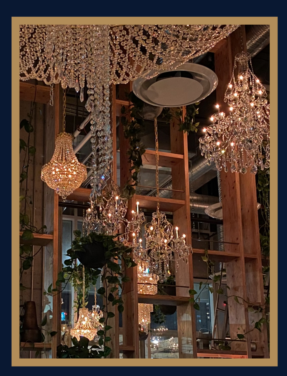
Syndicate Hospitality Group is proud to present Orchard Restaurant: a lush dining experience in the heart of the city.